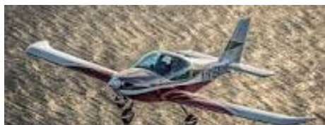
Czech LSA Design Emerges at Sun 'n Fun